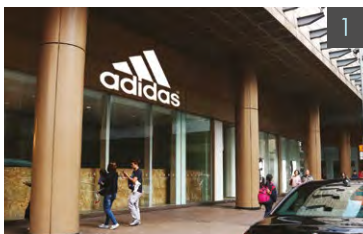
Pick-up/Drop-off point: In front of Langham Place Mall entrance on Shanghai Street (near Adidas)