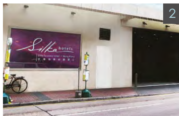
Pick-up/Drop-off point: Silka Seaview Hotel on Shanghai Street